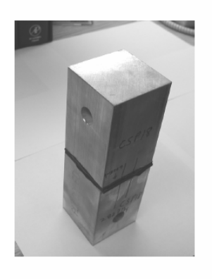
AF 163-2 Adhesive